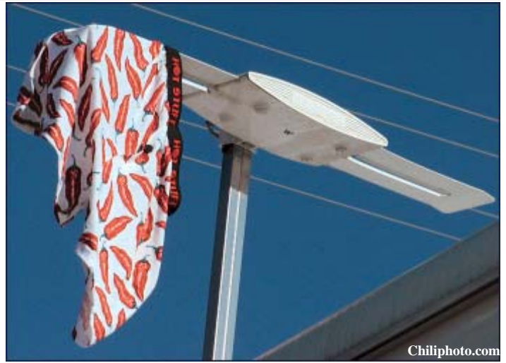
One can only imagine...